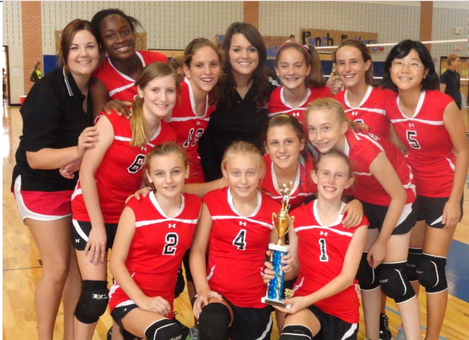
Congratulations HSES Varsity Volleyball Team! 2011 Middle School Mustang Classic 8th Grade Silver Bracket Champions