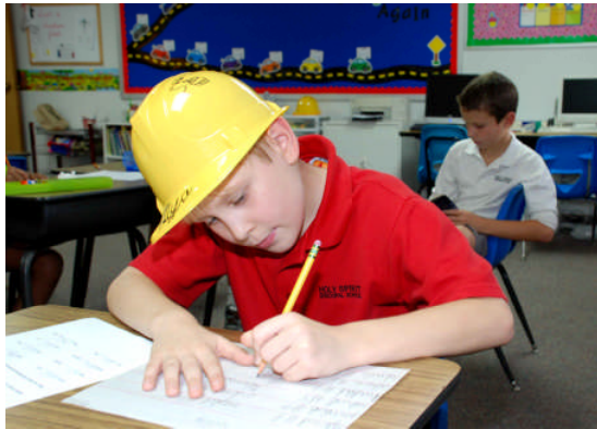
(left) A 4 th grader works hard and is well protected!