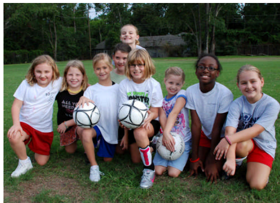
4 th Grade girls have their first practice!

Come see our lower school teams playing on fields all over West Houston, Saturday afternoons on a field near you, beginning September 26 th !