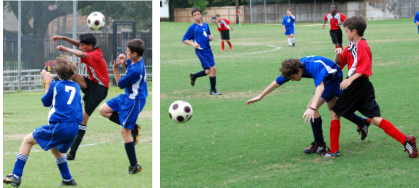
(top left) A 7 th grader returns a ball while the JV Volleyball team looks on. (top right) An 8 th grader stretches for the ball while teammates look on. (left) An 8 th grader wins a header in the midst of two defenders! (right) A 5 th grader takes down the opposition!