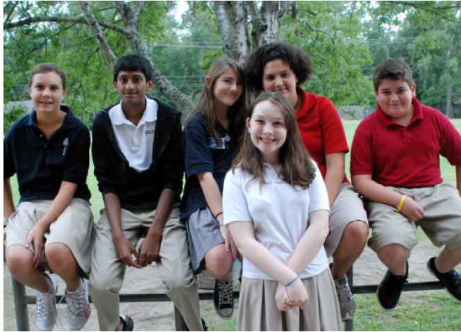
Our 2009 Student Council officers! (from left) Treasurer, Vice-President, Secretary, President, Chaplain, and Historian.