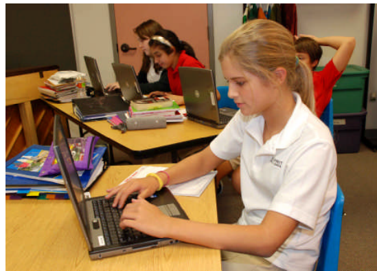
(right) 8 th graders write an original play in Theatre Arts, which they will perform later in the year.